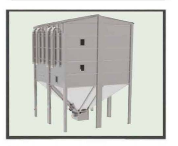
Apex roof for areas with high snow loads