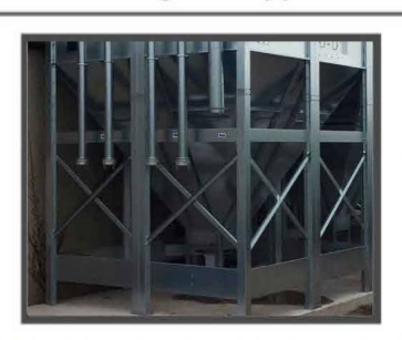
A 60 Degree Hopper Allows for smoother flow of pellets