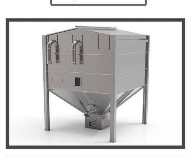
Optional roof design for use in areas that experience high snow loads