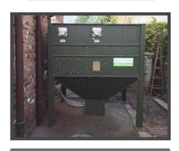
PVC coated finish gives the product a 30 year outdoor life