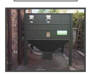
PVC coated finish gives the product a 30 year outdoor life