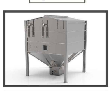
Optional roof design for use in areas that experience high snow loads