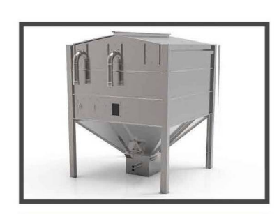
Optional roof design for use in areas that experience high snow loads