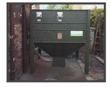
PVC coated finish gives the product a 30 year outdoor life