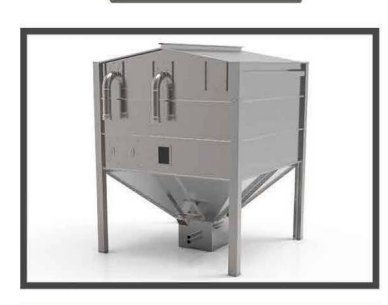
Optional roof design for use in areas that experience high snow loads