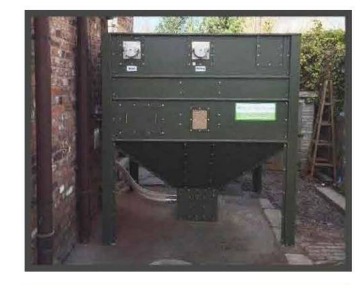
PVC coated finish gives the product a 30 year outdoor life