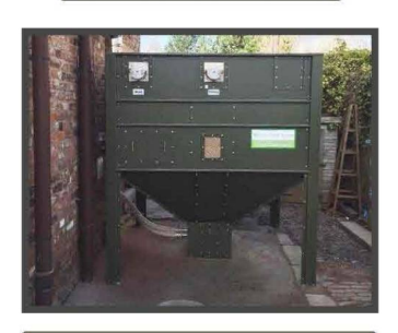
PVC coated finish gives the product a 30 year outdoor life