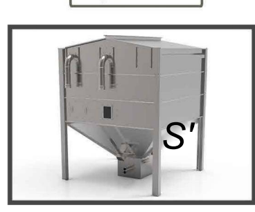
Optional roof design for use in areas that experience high snow loads